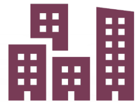
2,000,000 sq. ft. of new office space added to Vancouver market between 2015 and 2018